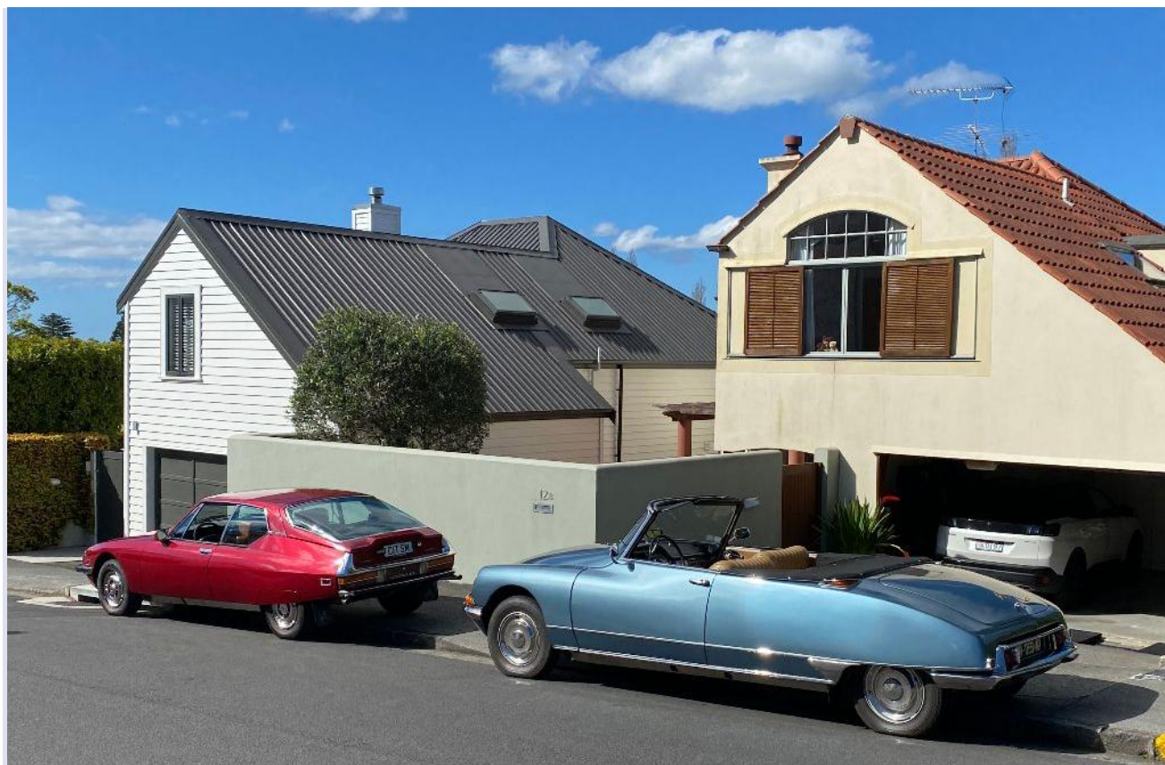
La Belle meets La Bête in Auckland