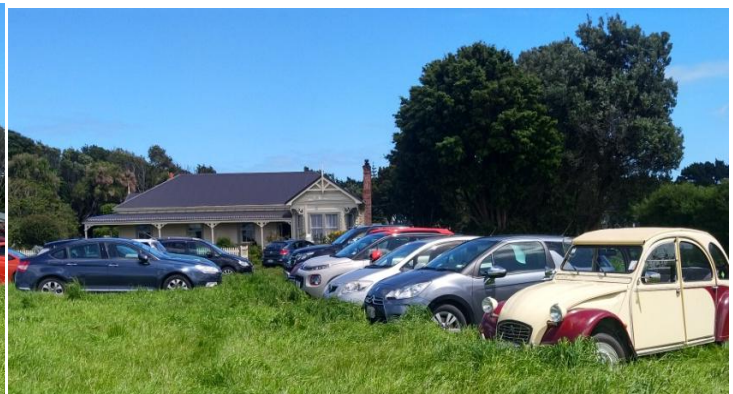
Our Citroëns (mostly) in the paddock at Myron Bent & Kerry Walker art studio

Whimsical garden feature at Jabulani, Okiawa – boy chasing cat up ladder, both fashioned from chicken wire mesh.