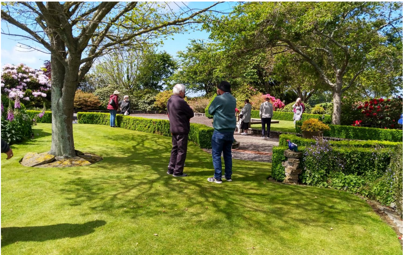
Sullivan Garden – impressive immaculate rural spread to the east of Hawera