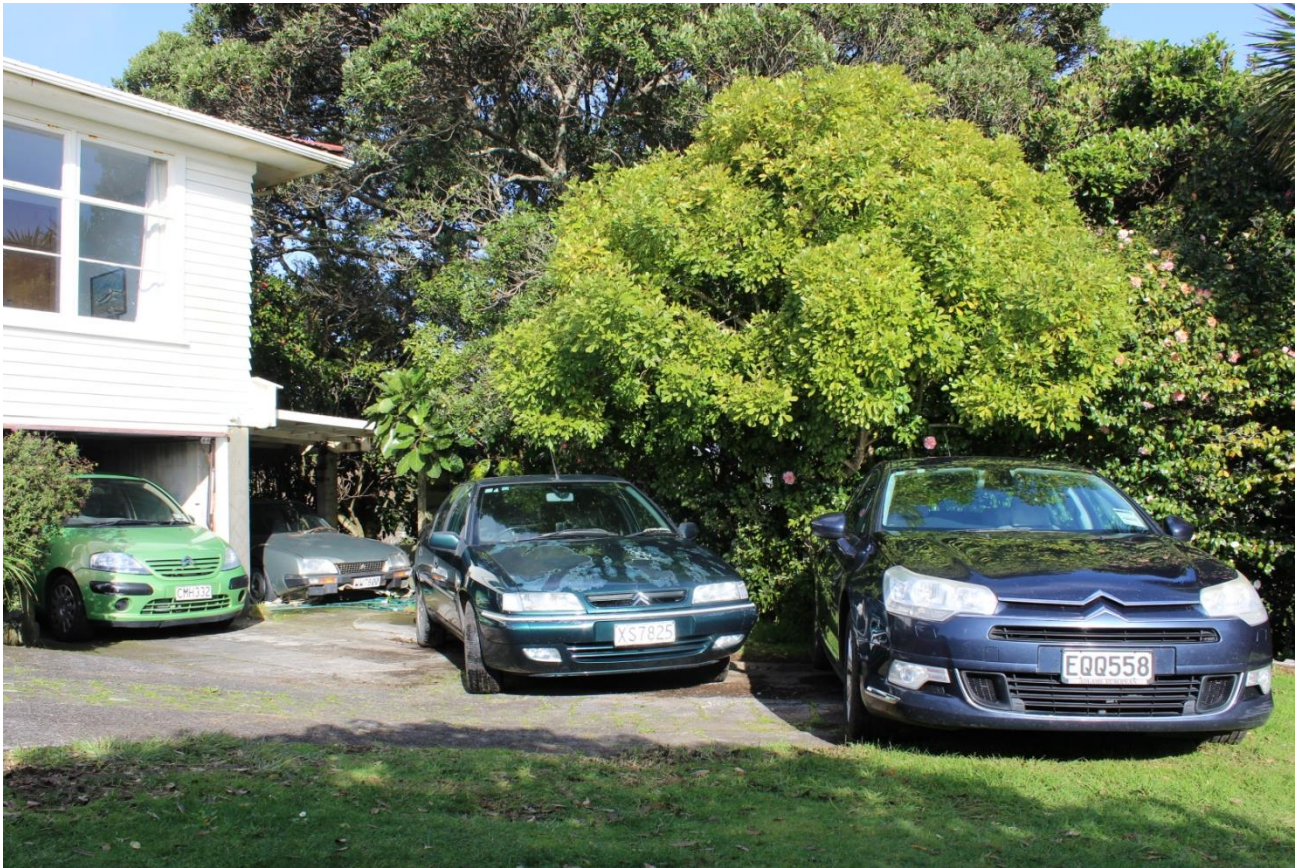
The Hill household in New Plymouth – C3, CX, Xantia, C5

The Magazine of the Auckland Citroën Car Club Inc