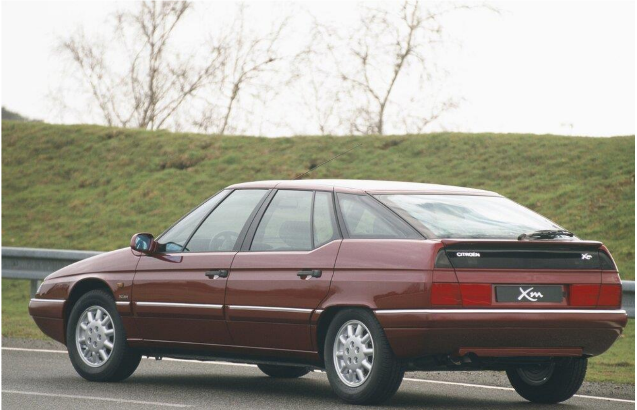
The Citroen XM was launched in 1989 and retired 11 years later.

NewsModern Classic Jul 29 Written By Matt Chapman