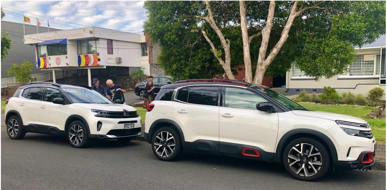
The two black & white C5 Aircrosses

It was encouraging to see such a good turn-out and I hope that this augurs well for other club events through the year.