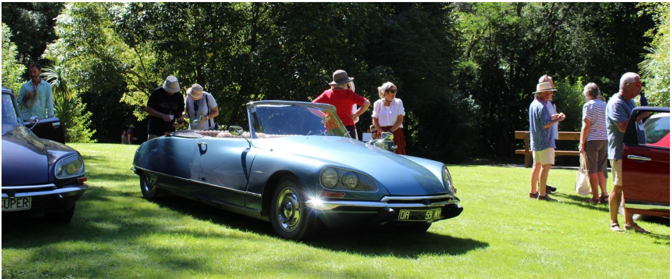
The Chapron at Ashley Gorge during the Navigation / Spotting Run