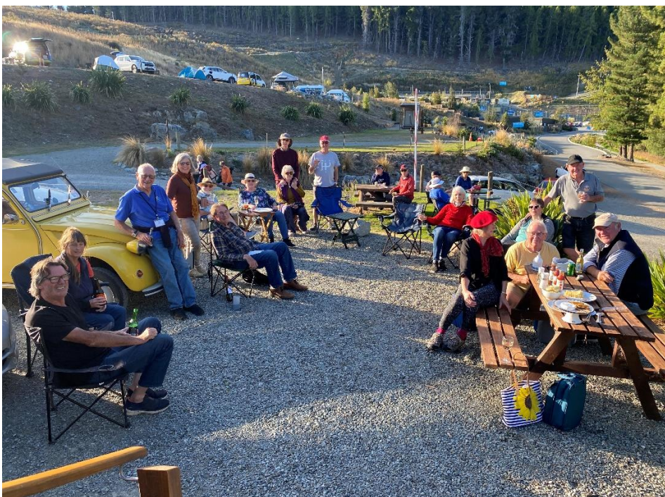
Barbecue at Lake Tekapo

Geraldine was our overnight stop, then onto a heritage steam railway at Pleasant Point. The day finished with a stop at Lake Tekapo, with a great BBQ meal put on by some of our group at our accommodation.