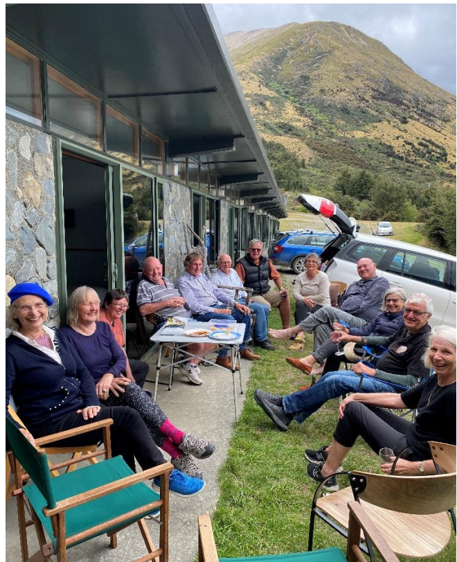
Drinks at Ohau Lodge

Day 5 involved the drive to Lake Wanaka over the stunning Lindis Pass, through beautiful tussock country.