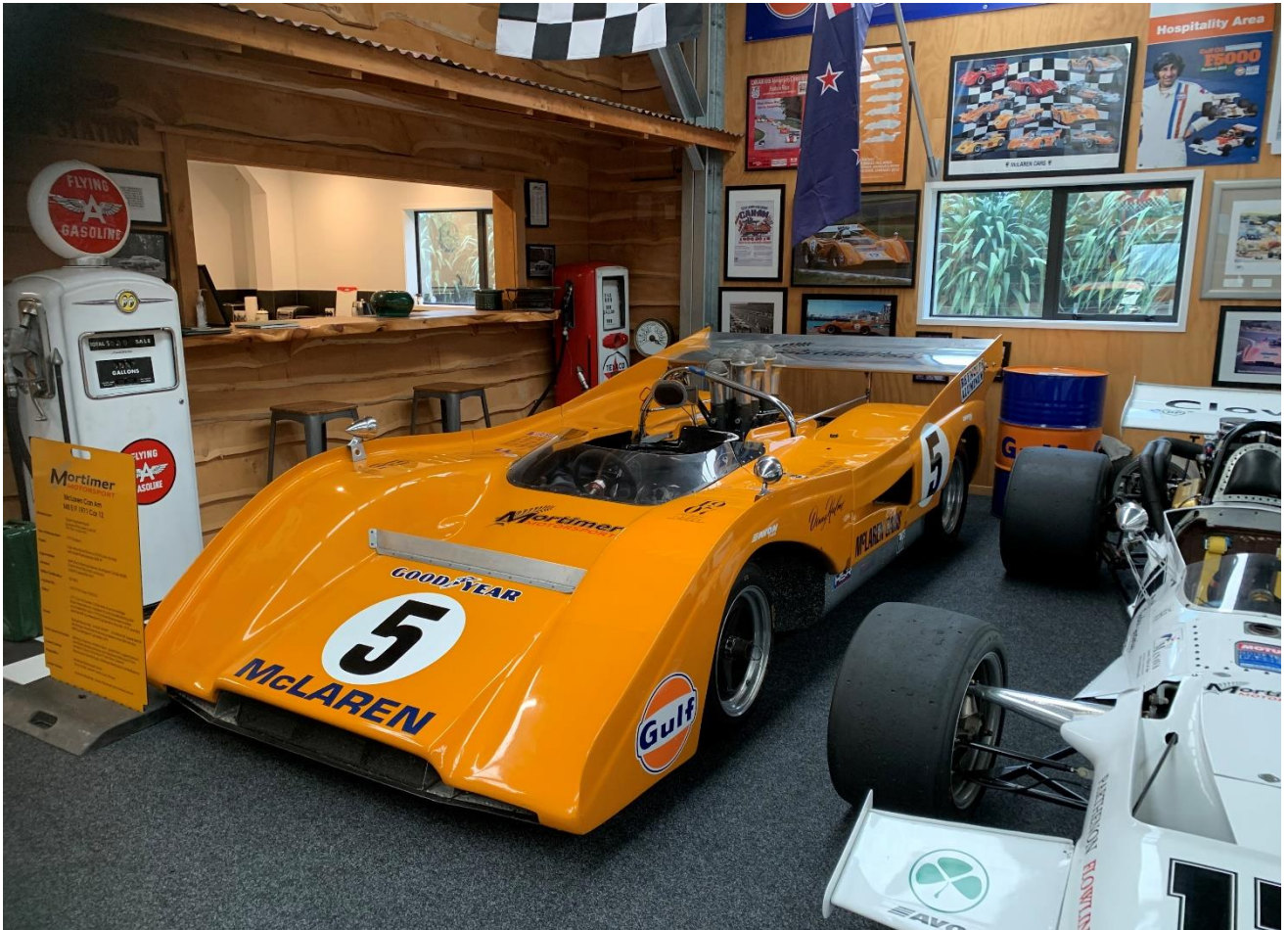
The McLaren M8