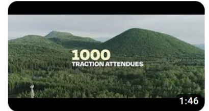
Film promotionnel pour les 90 ans de la Traction avant