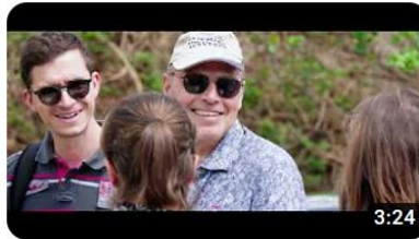
Let's go pour les 90 ans de la Traction avant

You'll find these videos on our Youtube Channel , along with testimonial videos from our foreign correspondants.