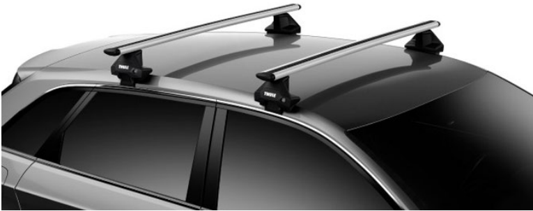
Photo 1 on the left shows the general style of the Thule two-bar roof rack. (This is not a 2CV rack. This is not a 2CV!)

The rack consists of two parts: Thule code 391000, the ProBar Evo 135 extruded aluminium bars, and Thule code 9512 (or 951200), the Rain Gutter steel mounts. The components are beautifully engineered and manufactured. The materials are exceptionally strong yet light in weight. We may not be able to lift the 2CV off the ground using the roof rack, but we'd go close! We need 2 x bars and 4 x mounts.