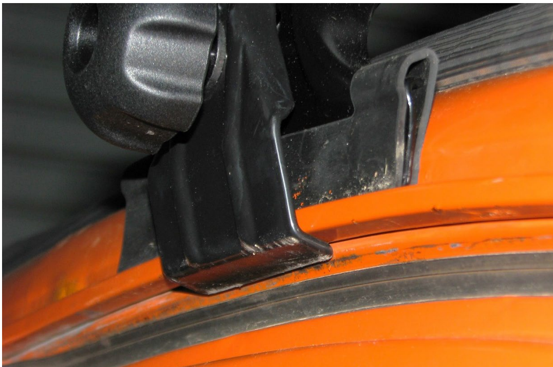
Photo 4 above shows the adjustable clamp of the mount firmly wrapped underneath the gutter. This locks the gutter solidly between the upper mount and the lower clamp, holding the steel mount "welded" in place on the vehicle.