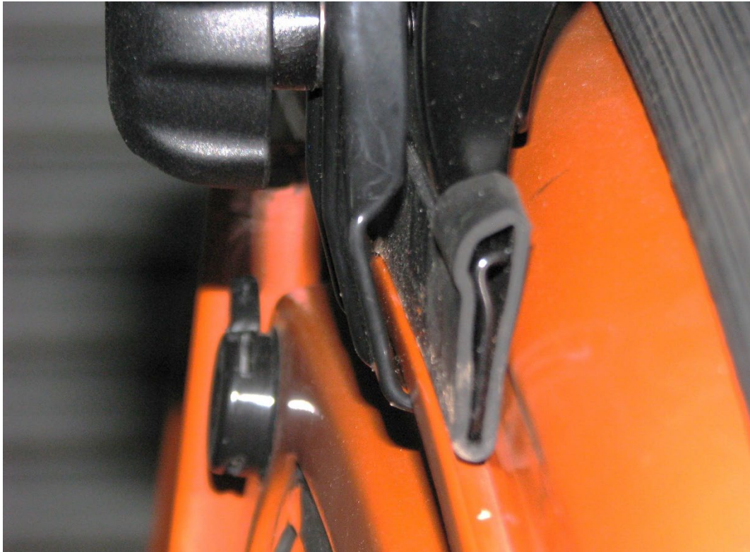
Photo 3 above shows one end of a rubber-sleeved steel mount sitting in the rain gutter, hard against the bottom of the gutter where it normally travels. The mount can't move sideways once locked in place and the rubber sleeve ensures the steel mount does not damage the vehicle paintwork.