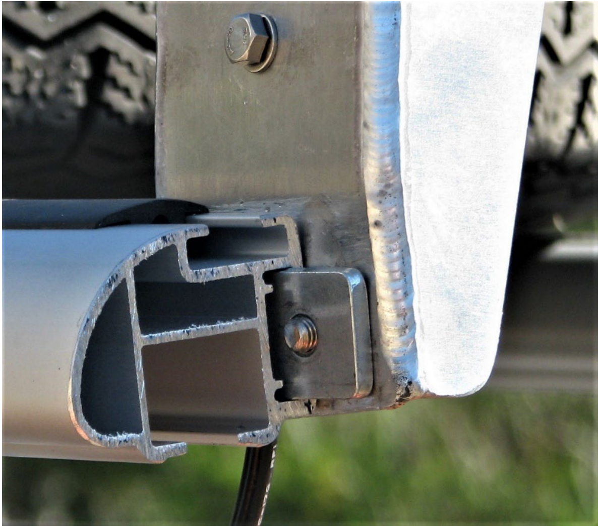
Photo 9 above is a close-up of the left end of the front bar and shows one of the two antenna mount securing bolts and “nuts”. (The black plastic protective cover on the end of the bar has been removed.) The visible “nut” is partially inserted into the extrusion channel in the rear edge of the roof rack bar. ARB was able to supply the two stainless bolts and the two “nuts” of the correct size for the extruded channel. You need the two “nuts” to be as large as possible but still able to slide freely inside the channel with the bolts loosened.