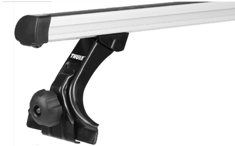
Photo 2 on the left shows the components used for the 2CV roof rack – the aluminium bar and mount. As noted above, we need 2 x bars and 4 x mounts. Each steel mount has a protective rubber sleeve (not shown) which fits over the mount to protect the vehicle paintwork.

Photo 1 on the left shows the general style of the Thule two-bar roof rack. (This is not a 2CV rack. This is not a 2CV!)