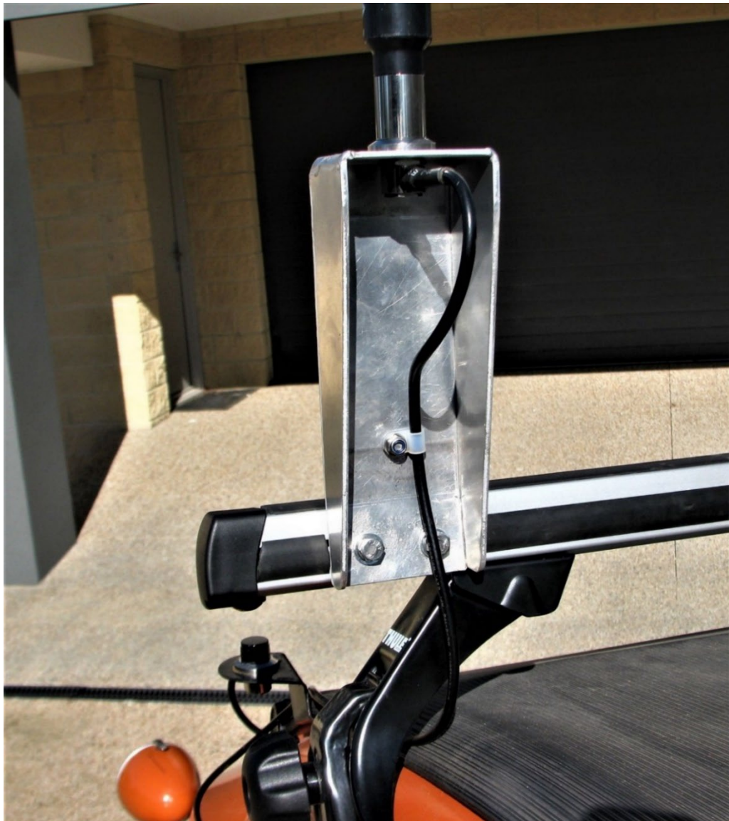
Photo 7 above shows the four-sided antenna mount secured to the rear face of the front bar of the roof rack, held by the two stainless bolts shown and two hidden “nuts”. Shows the form of the aluminium mount and the cable clamp. Do not make the cable bend radius too tight where it exits the MBC fitting or else cable damage will occur over time.

You don't want the cable moving in the wind or it will eventually fatigue and need to be replaced.