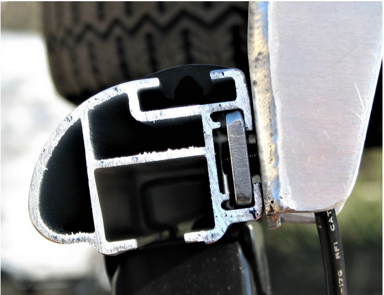
Photo 10 above is another view of the end of the bar, showing the slotted extrusion channel (before the aluminium edges were filed smooth). It also shows the outer-most “nut” positioned in the channel. Ensure the two mounting bolts are not too long to where they bind against the inner face of the channel when tightened.

Note the extent that the rear (flat) face of the bar is leaning slightly forward, i.e., a few degrees forward from true vertical. This small angle has to be accommodated, in some manner, in the building of the metal mount to ensure the antenna rod is at true vertical when in position on the vehicle as already noted. (Ignore the tyre angle. It was being separately supported at the time the photo was taken.)