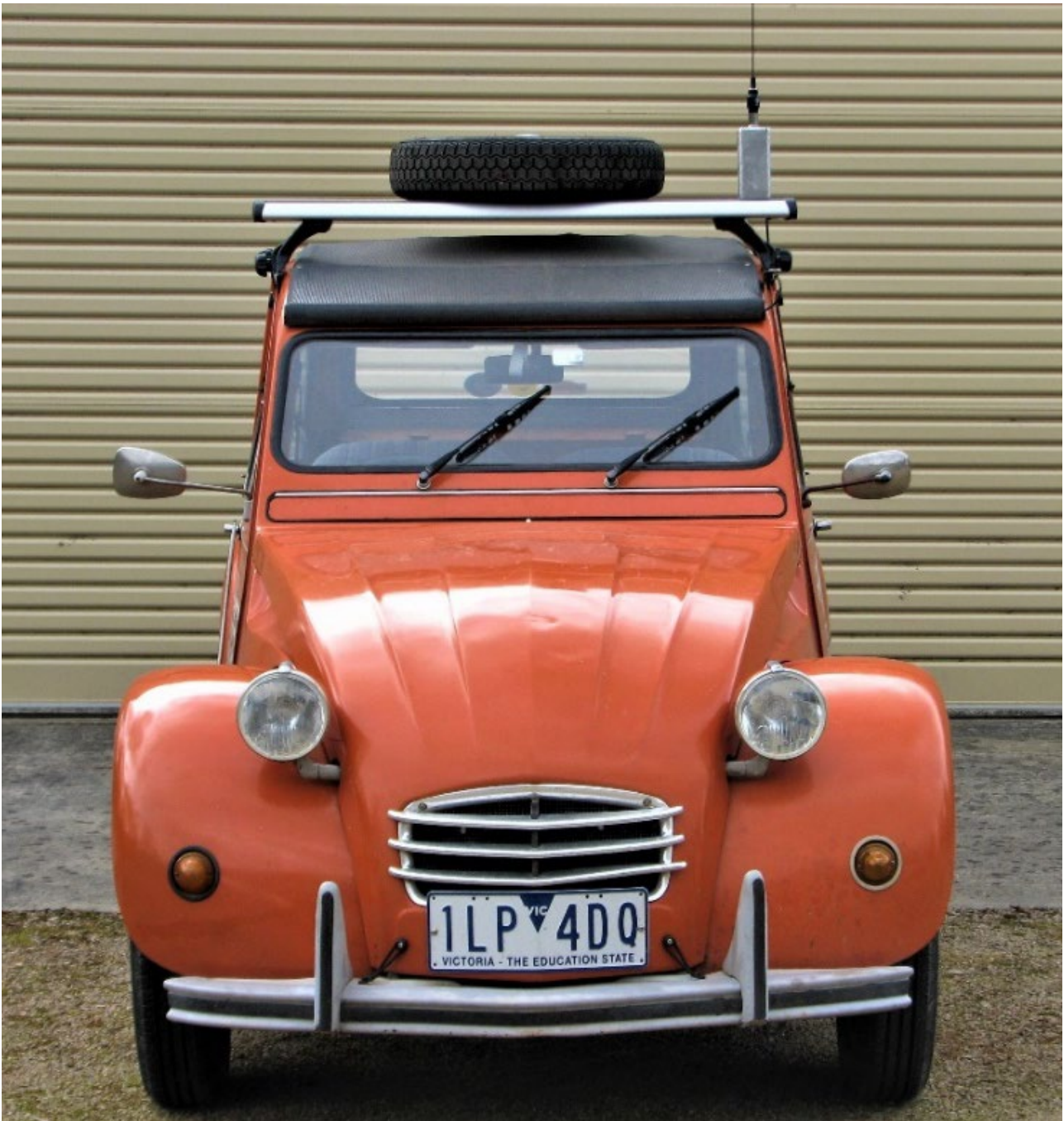
Photo 11 above shows the finished installation on the writer's Raid 2CV. It shows the roof rack, the spare wheel, the metal mount and the antenna, and shows the antenna base being higher than the spare wheel. Job done!