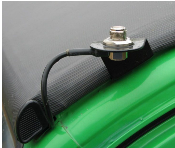
Photo 3: Antenna mounting base fitted to the mounting bracket with the antenna whip removed. Ensure the coaxial cable is not kinked, jammed in, deformed, caught, folded in a tight radius or damaged in any way to ensure it operates at its maximum performance with maximum reliability and longest life. The antenna base's chromed mounting fixture, shown above, is a well-engineered fitting.

The photo above shows the writer's antenna mounting bracket fitted to his orange 2CV, positioned forward on the inside edge of the metal roof structure on the passenger's side. It locates the base of the antenna in line with the highest point on the vehicle. Ensure the mounting face of the antenna bracket is dead horizontal so the antenna is positioned at true vertical to maximise communication range. Yes, check with the spirit level as it's vitally important. The bracket shown here is the writer's experimental one! The second bracket, in the photos which follow, has less holes drilled in it!