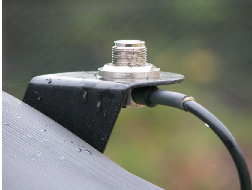
Photo 4: Close-up of antenna MBC mounting base, minus the plastic dust cap.

A small plastic dust cap (not shown in these photos) is supplied with the antenna for screwing onto the threaded mounting base to protect it from damage from dust, stones, water etc whenever the antenna is removed for stowage.