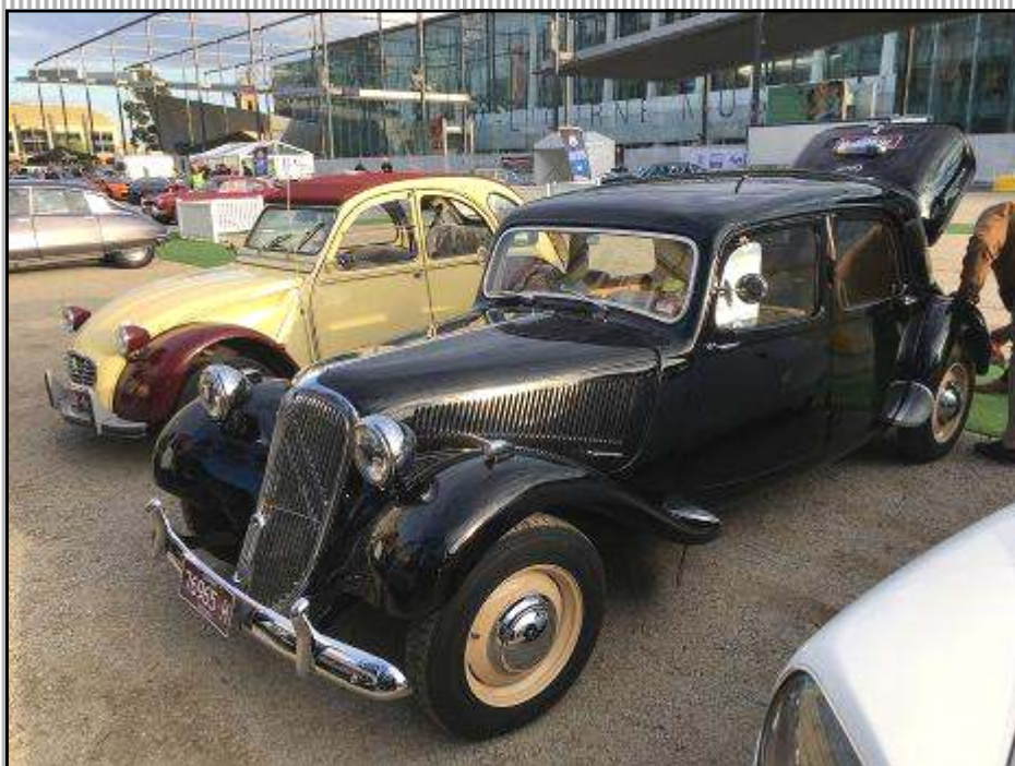
TG: 2CV and Traction at Club Sandwich