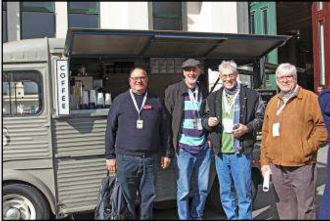
FS: Boys at Motorclassica