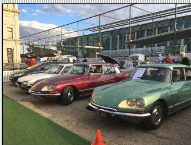
TG: Dees at Club Sandwich