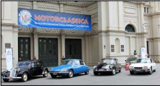
FS: The Entrance