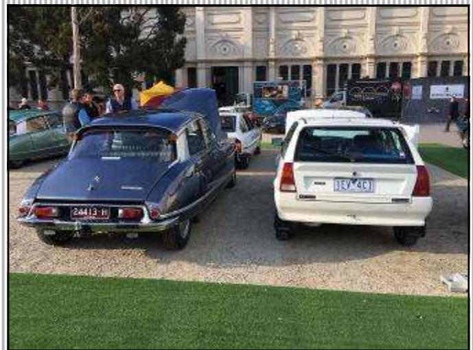
TG: DS and AX Gti.