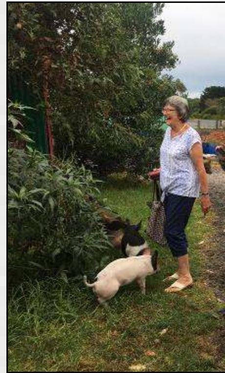
The amused on