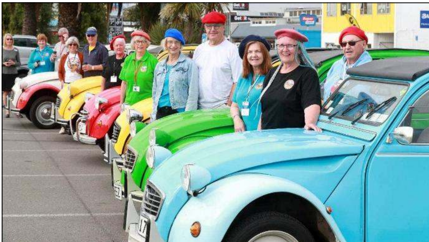
Citroën 2CV enthusiasts gather at the Blenheim Railway Station on Monday morning for the first leg of their “raid”.

Keep your eyes peeled: a colourful group of little French cars have arrived to “raid” Marlborough’s more scenic roads.