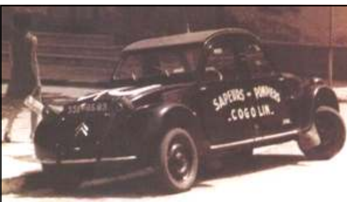
The original Cogolin

The Cogolin, also known as the 2CV Bicéphale or Two-headed 2CV, is a faithful reproduction of a unique custom car that was built in France in the 1950s. The original was dreamed up by a local fire and rescue official in the town of Cogolin in the southeast corner of the country. One night he encountered an obstruction on a narrow mountain road. There was not enough room to turn his car around, and he had to back up for several kilometers.