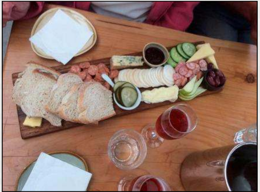
Lunch at Gurney's Cidery.