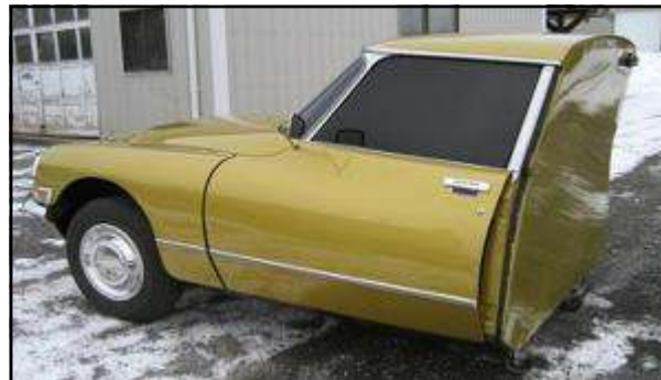
The back rides on casters