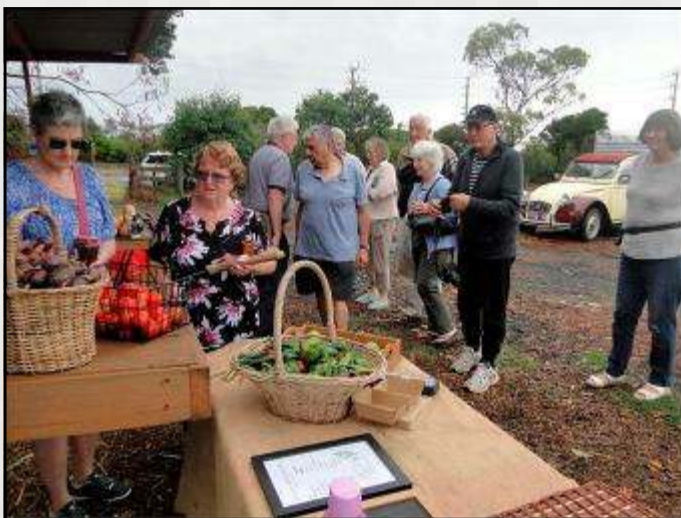
Buying at farm gate near VB.