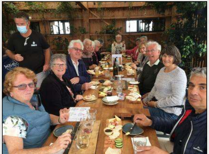
Lunch at Gurney's Cidery near Foster.