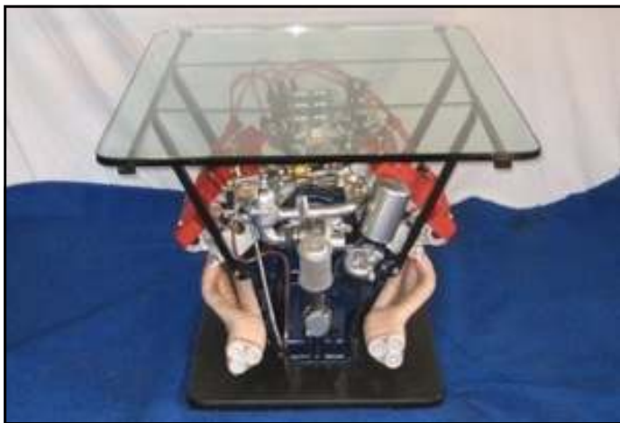
End view showing off the custom headers

For the finishing touches on the engine, we heat-taped the header pipes and remounted the carburetors, distributor, and other exterior components. Hooking up the ignition wires and fuel hoses helped make it look complete and functional.