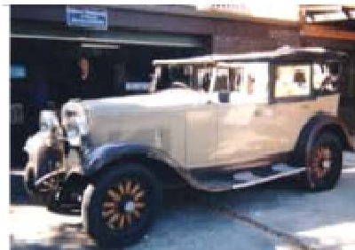
When purchased by Dee in 1999