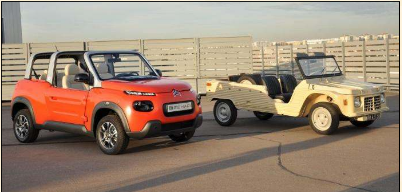
Citroën E-Méhari (left) and original Méhari (right)

And it's not an EV like the E-Méhari that Citroën offered from 2016 to 2019 (1,000 were produced). The For-est car runs gasoline and bioethanol.