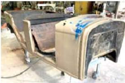
Body removed and ready for paint stripping & repair