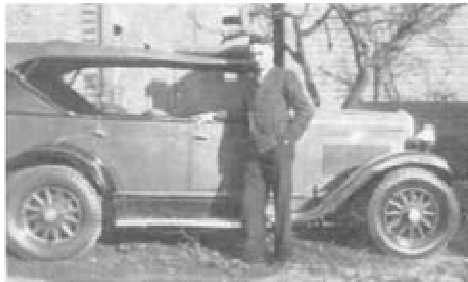
The original owner